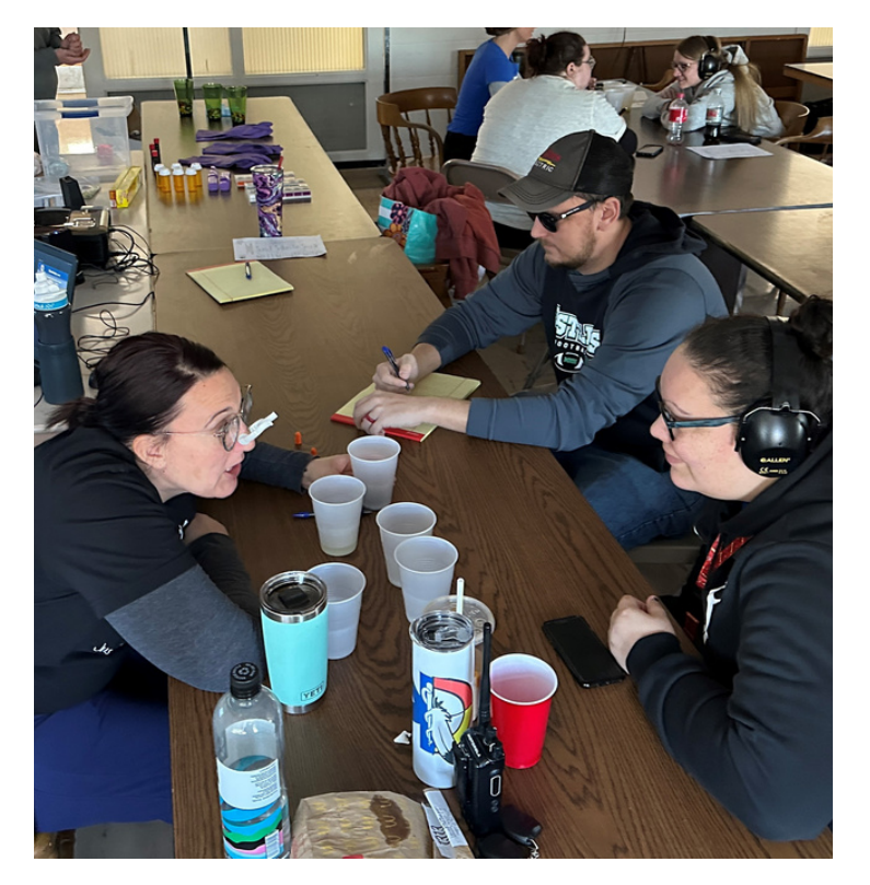
DISTRICT III District II held a 20-hour refresher on March 17 in Chamberlain, South Dakota.